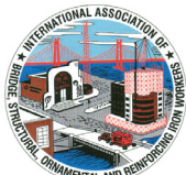
Iron Workers Local 846