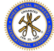
Sheet Metal Workers Local 100