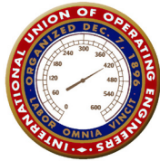
Operating Engineers Local 77