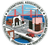
Iron Workers Local 201