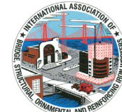
Iron Workers Local 568