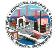
Iron Workers Local 28