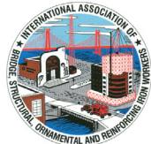
Iron Workers Local 5