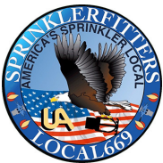
Sprinkler Fitters Local 669